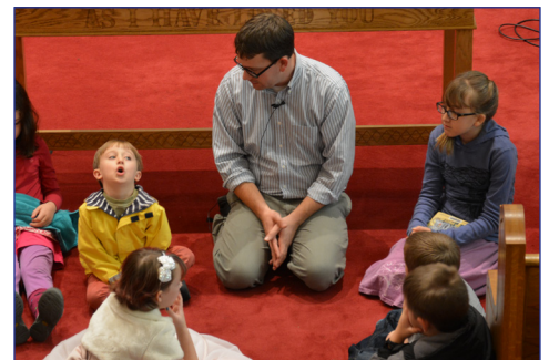
Have you ever made a mistake? No. Me? Never...