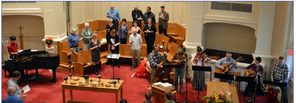
Combined service of choir and folk musicians; from If I Needed You to Amazing Grace.