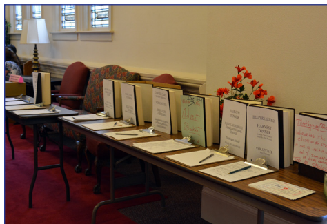
A phalanx of clipboards and folders; opportunities to participate and volunteer.