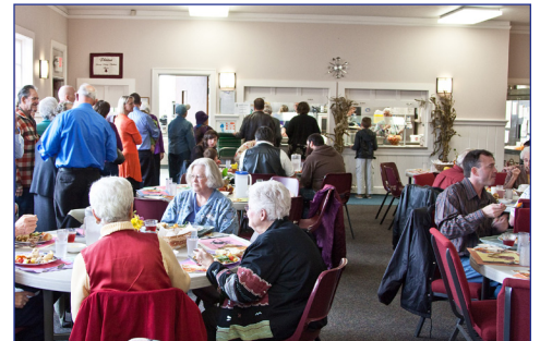
2013 Harvest Dinner at McLean Hall.

A donation basket will not be available at the dinner but contributions can be made at anytime.