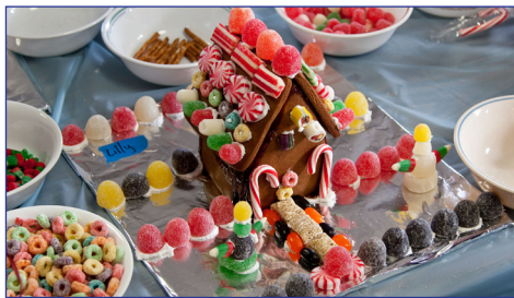
2013 Advent Faire Gingerbread house

The Advent Faire takes place on Sunday, December 14, the third Sunday in Advent, from 10:00– 1:00 p.m. It is an interactive and hands-on event to explore the meaning of Advent, children and youth are invited to participate in during and after church, lunch served after service. Come and build your dream gingerbread house!