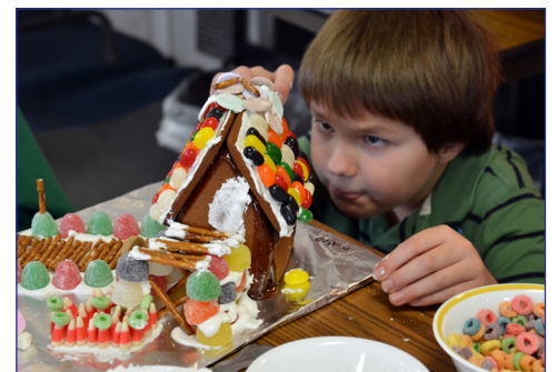
Left: Paper folding magic-Paper is transformed into a 3D box.