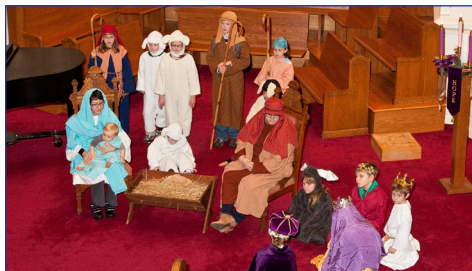
A scene from the 2013 Nativity play.

Christmas Pageant - Our children and youth (along with some kids at heart) present the Nativity Story. All youth and children are invited to participate. Be there at 9:30 to be in the play.