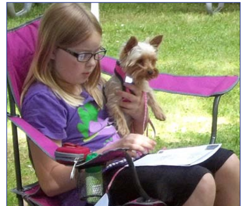
Sunday Service at Family Camp 2014

Get your reservations in early. Spaces are limited. Please contact the church office to make your reservation or if you have questions. Make your checks payable to First Christian Church with a notation that it is for family camp. Hope to see you there! It is always a fun time!