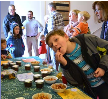
Mustard and pretzels are the perfect pairing.