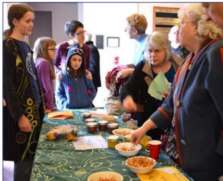
The congregation enjoys sampling.