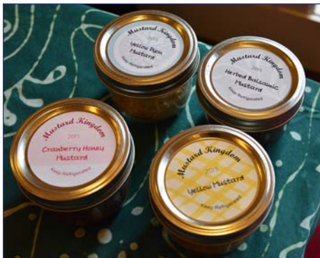
Four types of yummy mustards.