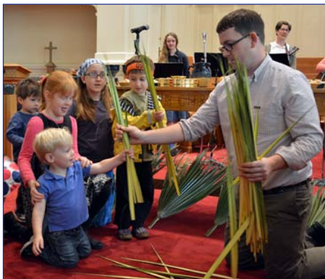
The kids passed out palm leaves to the congregation. Instructions were on hand on how to fold them into crosses.