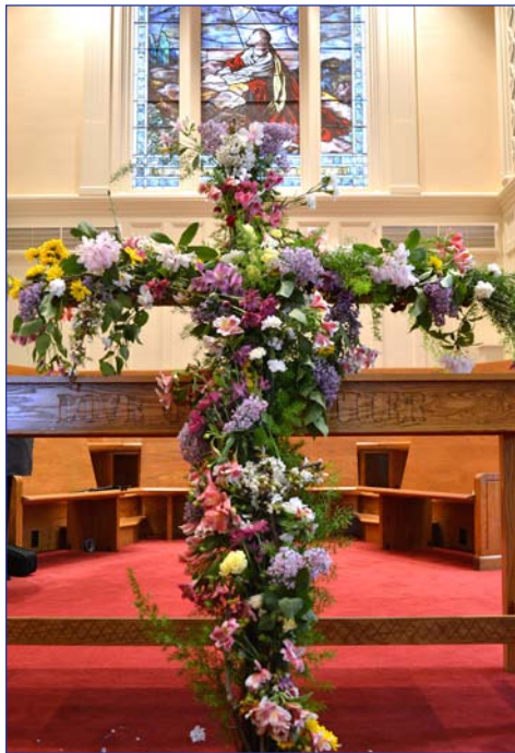
Easter 2014, the Flower Cross.

Church staff meets every Monday, 10:00-11:00 a.m. We are not available during this time.