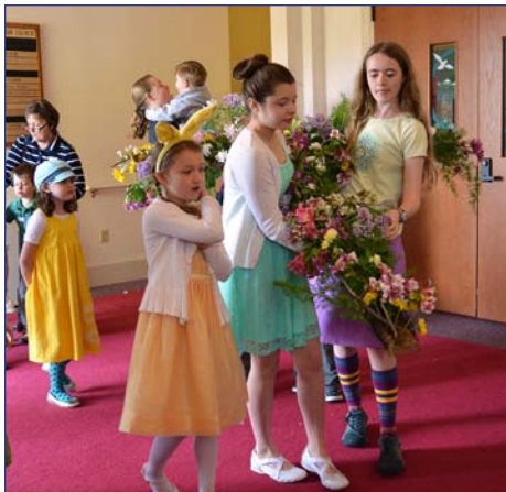
Sunday School kids prepare the Flower Cross for the sanctuary, 2014.