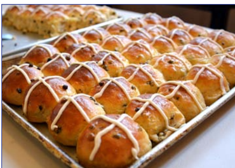
Remember the delicious hot cross buns from last Easter? Mmm!