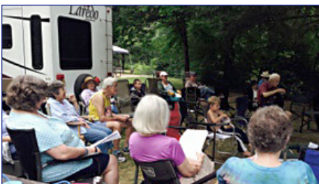
Shall We Gather at the RV