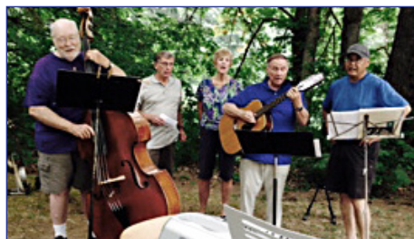
The Sunnyside Singers.