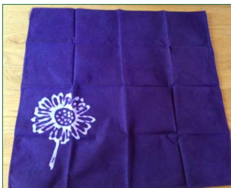
An example of the hand-dyed napkins that the Sunday School kids will make and sell at the FCC Craft Fair.