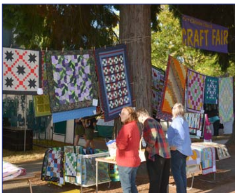
2014 Craft Fair Quilt booth