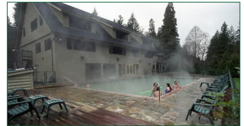
Belknap Hot Springs

A time for spirit, fun and fellowship next summer. Save the date for "The Gathering" at Belknap Hot Springs on the McKenzie River, June 23-26, 2016. Keep watching your Dispatch for more details.