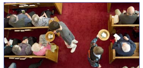
Youth Deacons do their part during intergenerational worship.